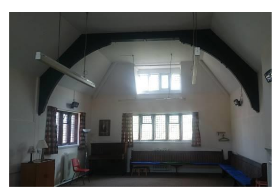
Statement of Significance

The late Victorian meeting house has high heritage value; the 1892 building retains most of its original architectural detail and loose furnishings and is particularly well cared for.