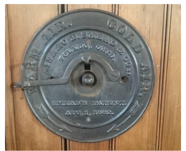
Figure 3: Original heating system by Isaac D. Smead & Co

covered with carpet tiles and historic benches are currently arranged in a square around a central table.