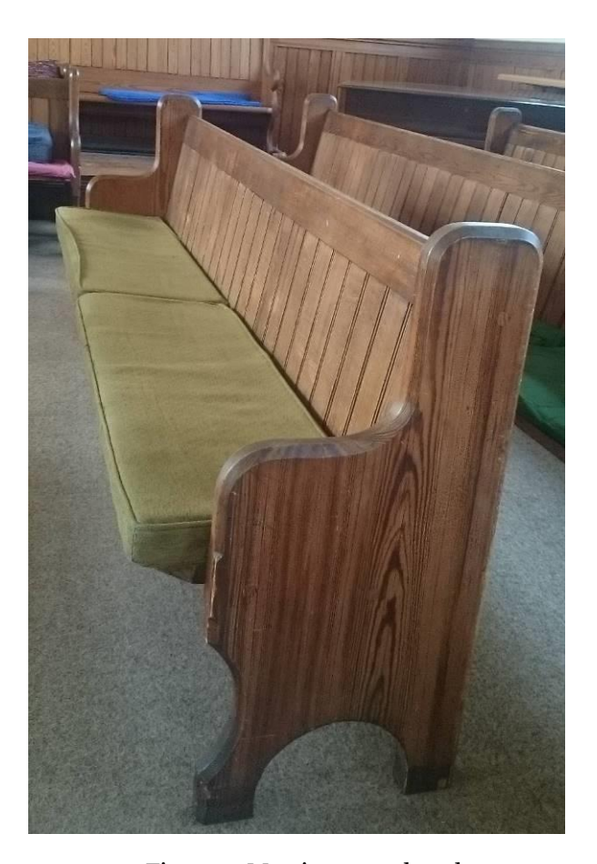
Figure 5: Meeting room benches

The main meeting room contains historic pine benches (fig.5) with vertical tongue and groove detailing to match the dado panelling.