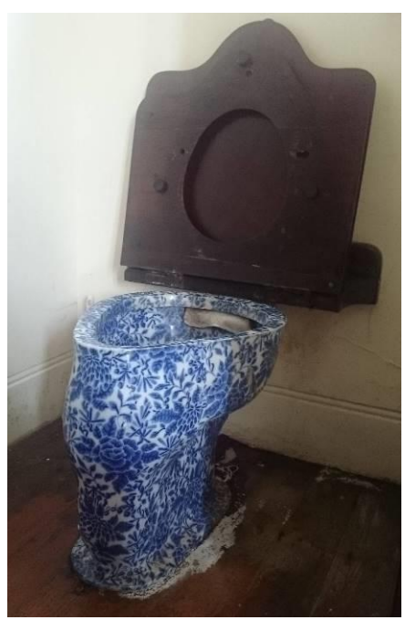
Figure 4: Blue and white patterned toilet bowl by Doulton & Co London

The WC facilities retain decorative ceramic toilet bowls and cisterns by Doulton & Co of London. The female toilet has an unusual blue and white patterned ceramic toilet bowl (Fig.4), and wooden seat.